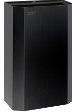
PPA2212B Black Finish