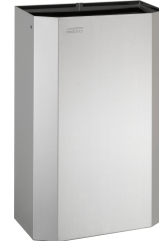
PPA2212CS Satin Finish