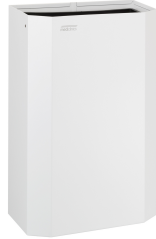
PPA2212 White Finish